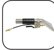
10-0501 4" S/S Upholstery Tool