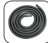
80-0503 25 ft. Vacuum Hose with Cuffs Assembly