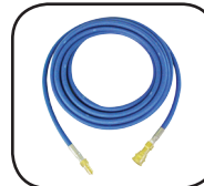
80-0502 25 ft. Solution Hose Assembly