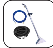
80-0500 Hoses and Wand Kit