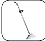
10-0861 12" S/S Dual Jet S-Bend Wand