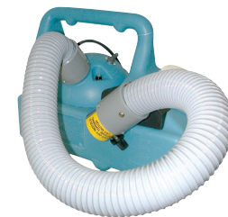
U.L.V. wet fogger.

Water (CAS # 7732-18-5), Propandiol (CAS # 504-63-2), Non-ionic surfactant, Sodium xylene sulfonate (CAS # 1300-72-7), Propreitary blend odor absorbent/polymer/fragrance, Glycol Ether PM (CAS # 107-98-2)